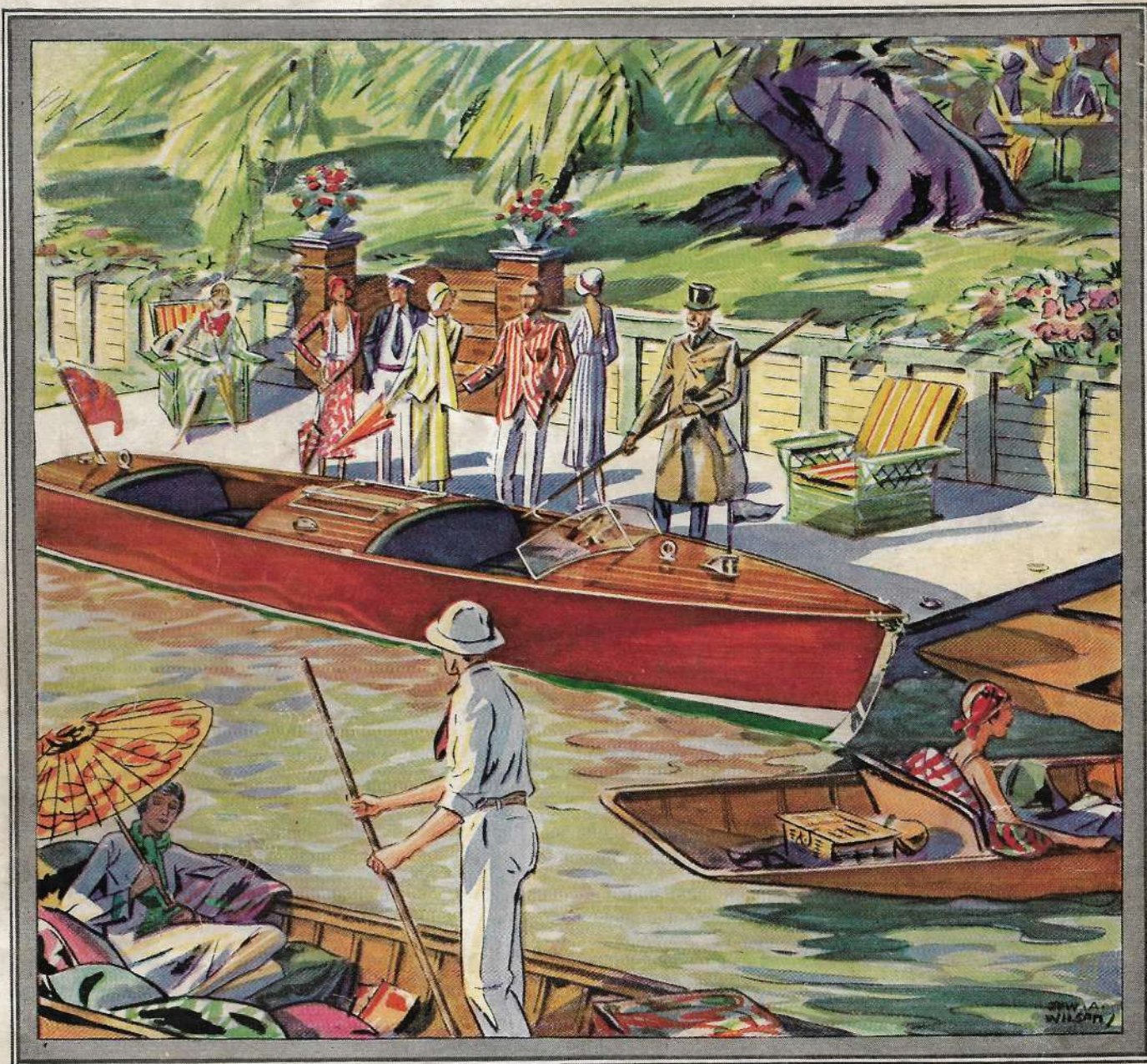
ILLUSTRATED IS THE 5-PASSENGER 16-FOOT RUNABOUT \ 40 H.P. MOTOR \ SPEED 25 MILES AN HOUR \ PRICE, FULLY EQUIPPED, $945

STORIED waters of many lands have purred a welcome to the new Dodge Boats \ \ \ Pictured here is England's River Thames — famous in fact and fable \ \ \ Only the miracle of modern mass production could create these new Dodge Boats at such amazingly lessened prices \ \ \ At $945 the new Dodge Sixteen Footer alone begins a new epic in boating history \ \ \ With mahogany planking from stem to stern \ \ \ bottoms double planked \ \ \ this gem of marine beauty is fully equipped from luxurious upholstery to electric starting and lighting \ \ \ with a 40 horse power motor ready to speed away from dock or mooring at twenty-five miles an hour \ \ \ It is merely one illustration of the striking values in the entire series of new Dodge Boats including \ \ \ the 35-miles-an-hour Twenty-one Footer at $2100 \ \ \ the 38-miles-an-hour Twenty-five Footer at $3200 \ \ \ and the 300 horse power Twenty-eight Footer with its better than 45 miles an hour at $4500 \ \ \ Victoria Sedans at $3900 to $5300 \ \ \ Write for a complete color catalog with descriptions of all Dodge Boats.