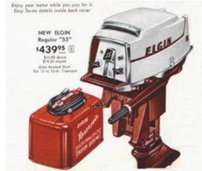
1958 Elgin 35hp

If you are looking for Art Dekalb's Elgin website (not affiliated with us) it is at the following link: Elginoutboard.com