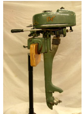
The first Elgin - 1946 1 1/4hp

Simple, reliable, easy to work on - the same virtues that made them good outboards 50+ years ago make them great old outboards today!