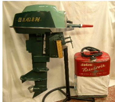
1955 Elgin 5 1/2 hp