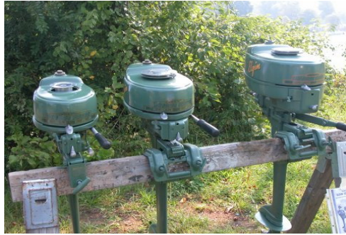
1947 1.25 hp , 2.5 hp and 5.5 hp model