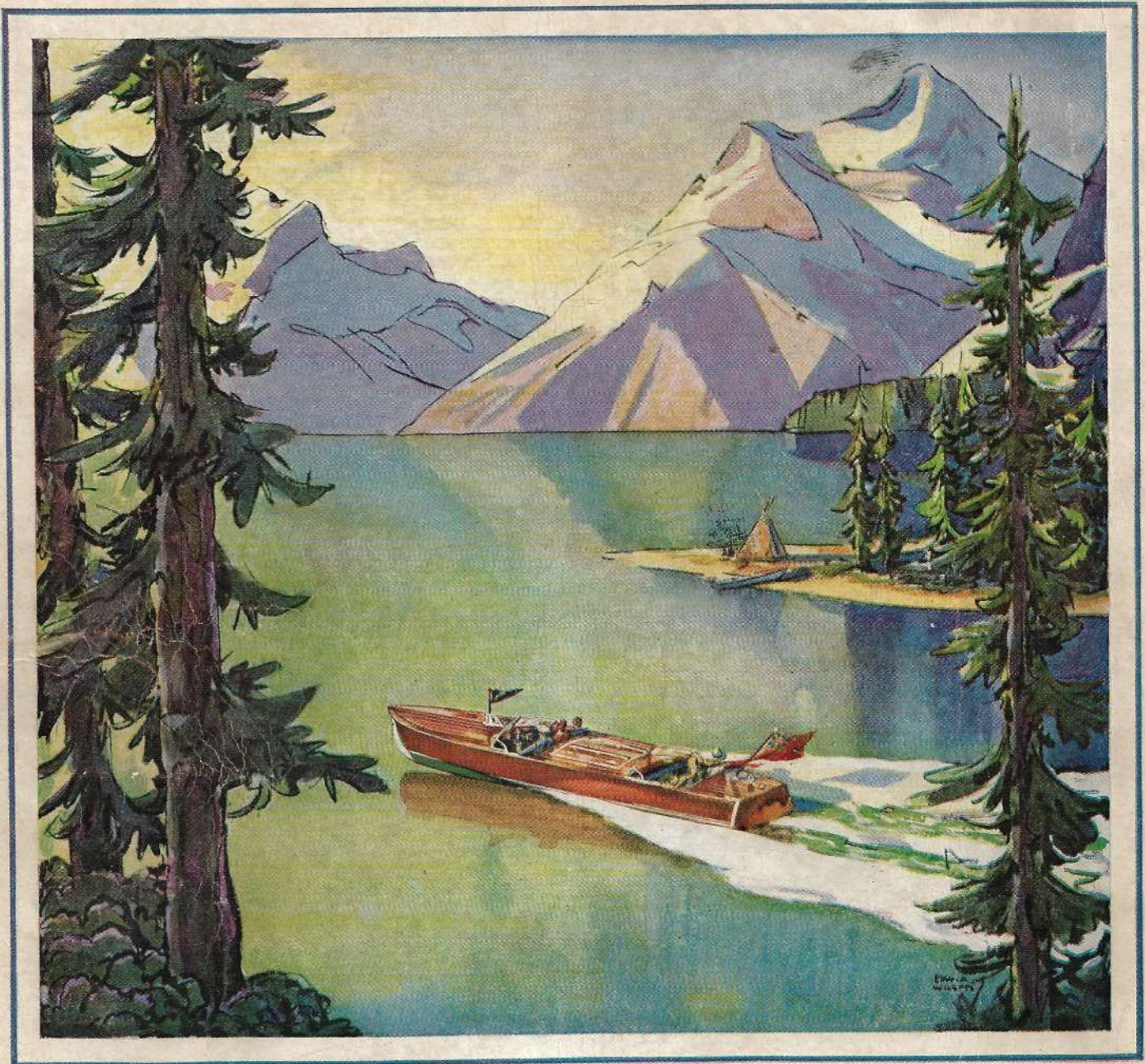
ILLUSTRATED: THE 21 FT. RUNABOUT—115 H. P. LYCOMING STRAIGHT 8 ENGINE—35 M. P. H. PRICE, F. O. B. WORKS, $2100

SKIM the crystal lakes that mirror Northern pines . . . or find a Northern coolness in a lazy evening cruise on waters nearer home . . . Whatever you want a motor boat to do, there is a Dodge Boat to do it dependably . . . Dollar for dollar, size for size, Dodge Boats are unique in seaworthiness, comfort, beauty, speed, value . . . The 30-mile-an-hour 40-horsepower 16-footer costs but $945 . . . Like all Dodge Boats it is planked with genuine mahogany, the bottom double-planked . . . The cost-reducing power of vast production, made possible by the unprecedented popular appreciation of Dodge values is evidenced too in the 21-footer at $2100, the 25-footer at $2500, the 28-footer at $3700, Victoria Sedans from $3900 to $5300 . . . Write for the new Dodge catalog that pictures and describes all Dodge Models.