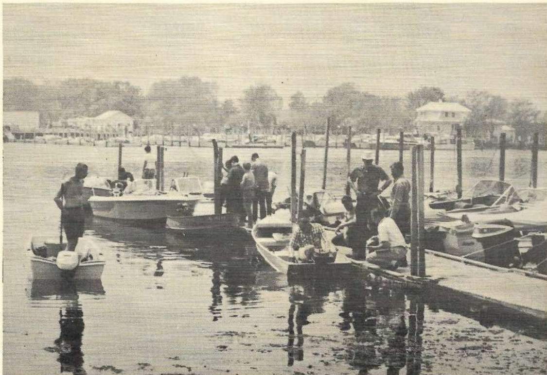
The pit at the New Jersey Antique Outboard Motor Meet.