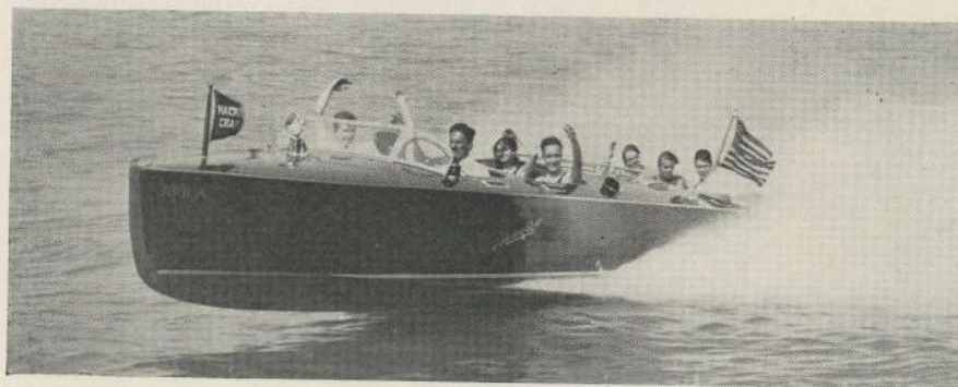
The 30-foot Hackercraft is an 11-passenger speed boat powered with the new Kermath "200." Speeds up to 43 m.p.h. are obtained.